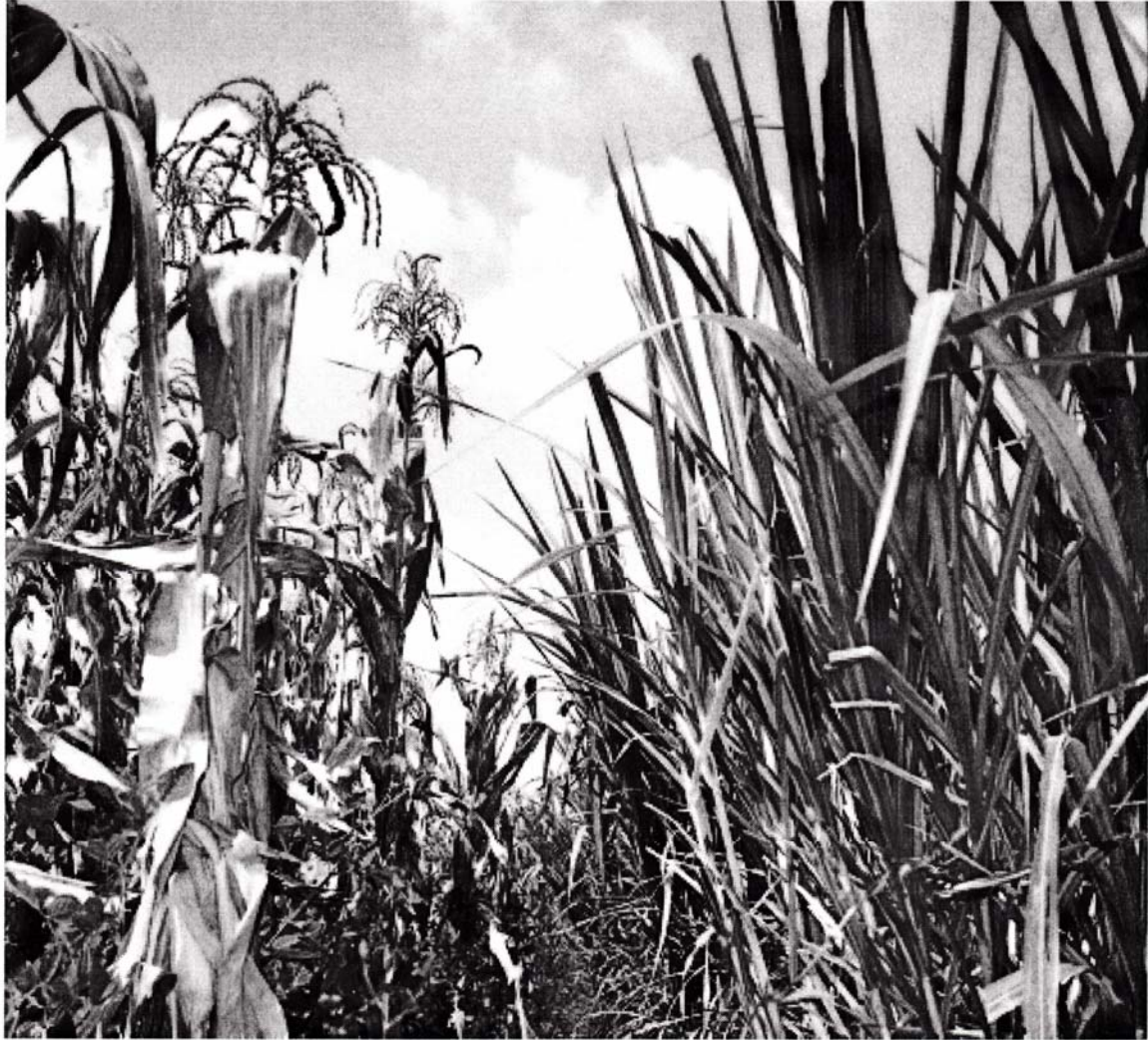
Napier grass growing next to maize. Attracted ('pulled') to the napier and repelled ('pushed') by the legume desmodium, the moths leave the maize fields and Kenyans employing the 'push-pull' method benefit from higher yields

maize, on the other hand, the technology comes in the seed, so that nothing can go wrong. "All the farmers have to do is sow, reap, and eat."