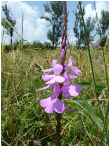
Figure 1. Striga hermonthica

Stemborers in Nyanza province, known in the local Luo as õKundi,õ belong to either the native Busseola fusca or the Asian species Chilo partellus . Unseen by farmers, the females lay their eggs at night on the young maize plants. Then, true to their name, the larvae enter the stem and begin to burrow after feeding on the leaves. It is at the larvae stage that the insect causes the most damage, leaving maize stems weakened, stunting growth, and chewing holes in the stems and leaves. After growing fully, the larva pupates within the maize stem, emerges as a moth, mates, and lays eggs, repeating its cycle of destruction. Stemborers cause average maize losses of 20 to 40 %, but can destroy up to 80% of the crop, making them the most devastating maize pests in Africa.