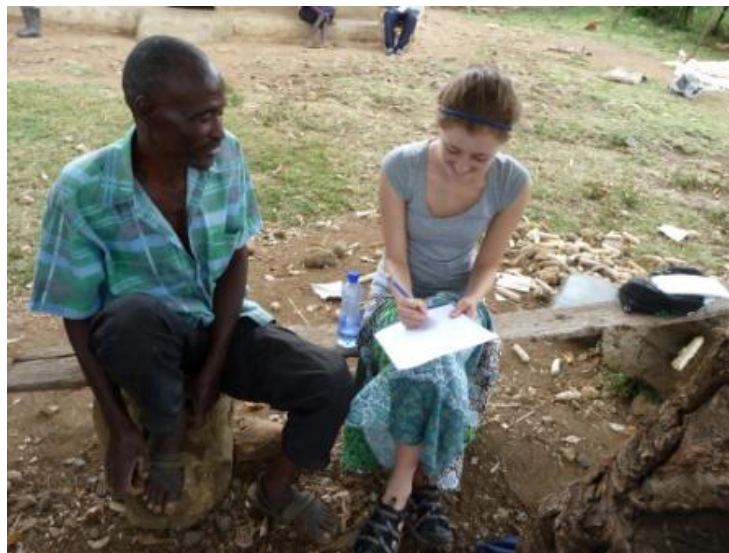
Figure 4. Interviewing a project farmer in Lambwe Division

After all 40 questionnaires were administered, I entered the farmers' responses into SPSS, a data analysis program. From that data trends were observed, analysis conducted, and conclusions formed.