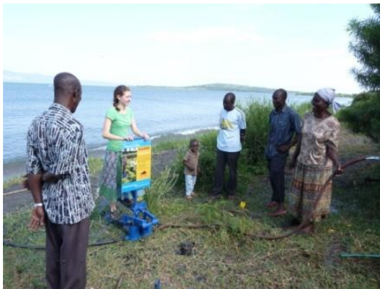
Figure 3. Testing a pedal pump on Rusinga Island

In Kenya, pedal pumps are sold by the American company KickStart. Their pumps, which are called Super MoneyMaker Pumps (Figure 3), have been adapted for use in Africa from those in Southeast Asia. The main difference is that they are portable and relatively light-weight compared to IDE's permanent pumps. KickStart also manufactures a hip-pump, which is operated with one's arms instead of legs and uses only one piston.