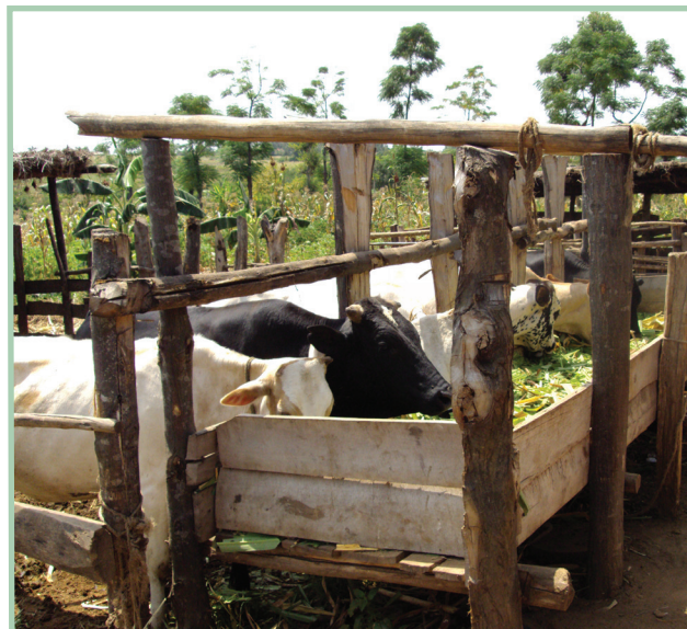
Livestock feeding on Brachiaria and Desmodium harvested from push-pull fields