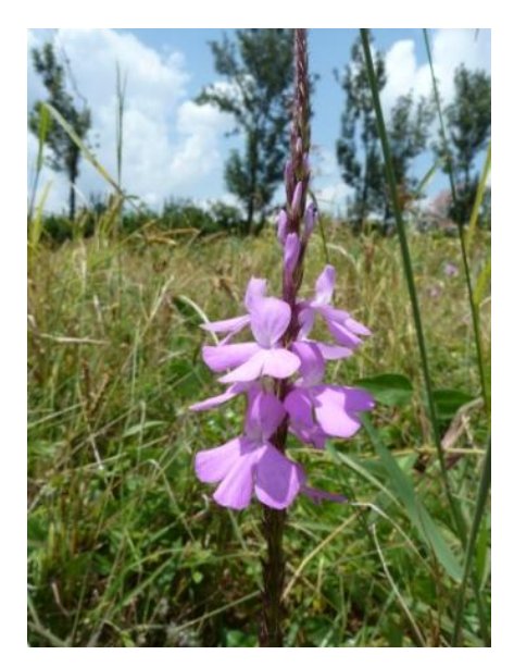
Figure 1. Striga hermonithica

Stemborers in Nyanza province, known in the local Luo as õKundi,ö belong to either the native Busseola fusca or the Asian species Chilo partellus . Unseen by farmers, the females lay their eggs at night on the young maize plants. Then, true to their name, the larvae enter the stem and begin to burrow after feeding on the leaves. It is at the larvae stage that the insect causes the most damage, leaving maize stems weakened, stunting growth, and chewing holes in the stems and leaves. After growing fully, the larva pupates within the maize stem, emerges as a moth, mates, and lays eggs, repeating its cycle of destruction. Stemborers cause average maize losses of 20 to 40 %, but can