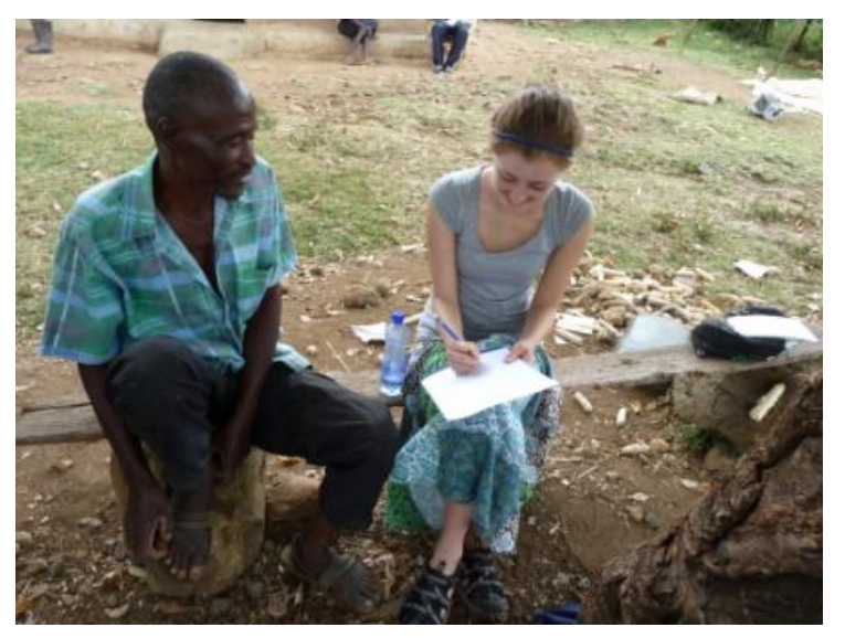
Figure 4. Interviewing a project farmer in Lambwe Division

After all 40 questionnaires were administered, I entered the farmersøresponses into SPSS, a data analysis program. From that data trends were observed, analysis conducted, and conclusions formed.