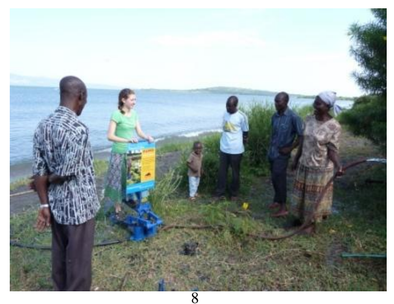
Figure 3. Testing a pedal pump on Rusinga Island

In Kenya, pedal pumps are sold by the American company KickStart. Their pumps, which are called Super MoneyMaker Pumps (Figure 3), have been adapted for use in Africa from those in Southeast Asia. The main difference is that they are portable and relatively light-weight compared to IDE¢s permanent pumps. KickStart also manufactures a hip-pump, which is operated with one¢s arms instead of legs and uses only one piston.